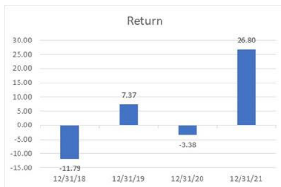
Annual Total Returns as of December 31

During the periods shown in the bar chart above, the Fund's highest quarterly return was 13.22% (quarter ended June 30, 2021) and the Fund's lowest quarterly return was -23.25% (quarter ended March 31, 2020). The calendar year-to-date total return of the Fund as of September 30, 2022 was 13.57%.